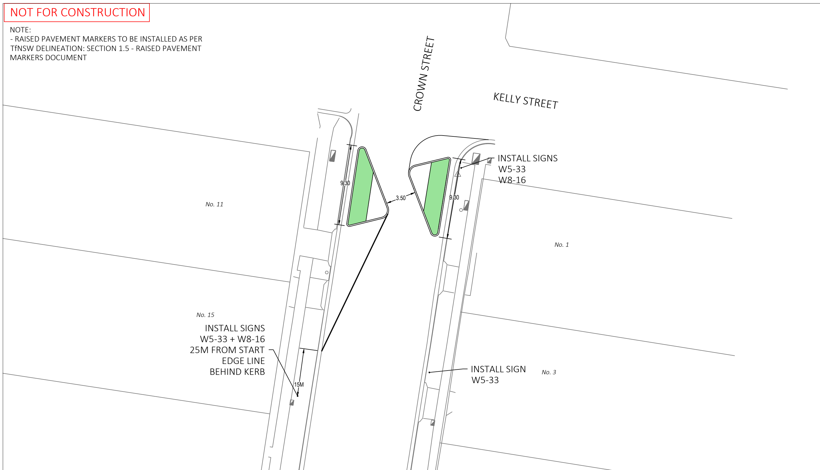
PLAN 2 - SINGLE LANE ANGLED SLOW POINT

NOTE: - RAISED PAVEMENT MARKERS TO BE INSTALLED AS PER TfNSW DELINEATION: SECTION 1.5 - RAISED PAVEMENT MARKERS DOCUMENT