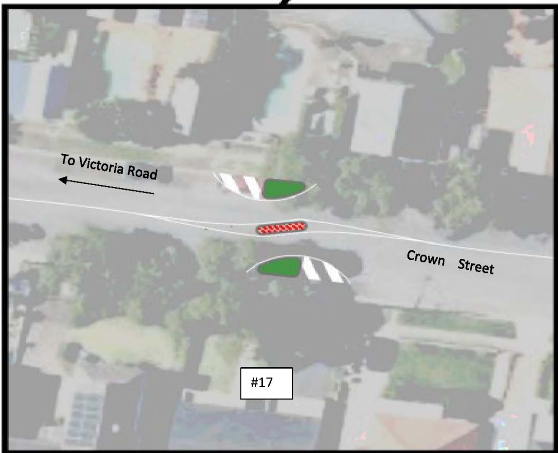
SOUTH OF KELLY STREET