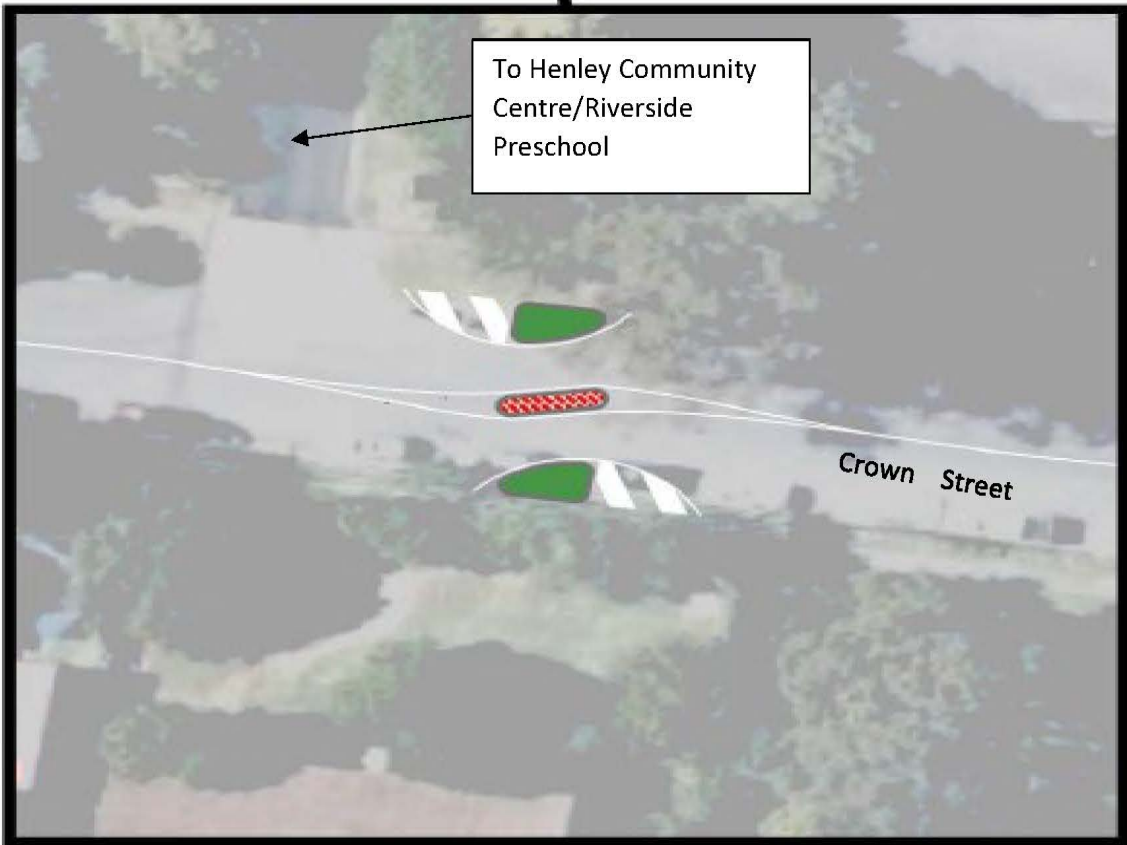
HENLEY COMMUNITY ENTRANCE