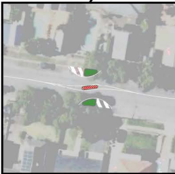
SOUTH OF KELLY STREET