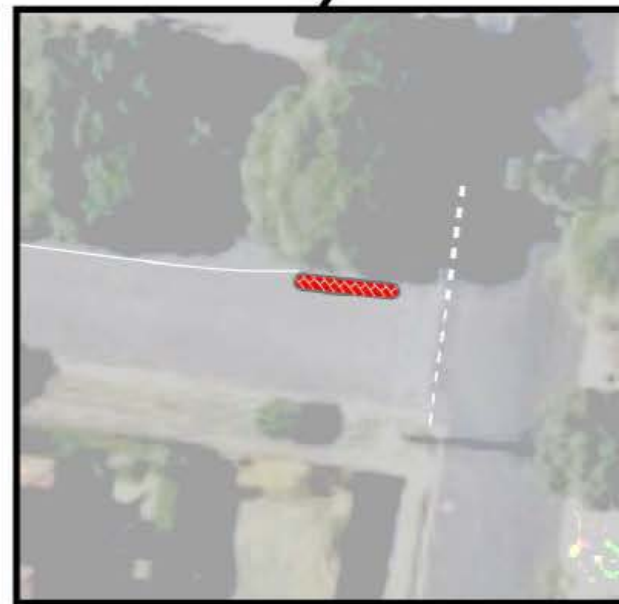
NORTH OF SHERWIN STREET