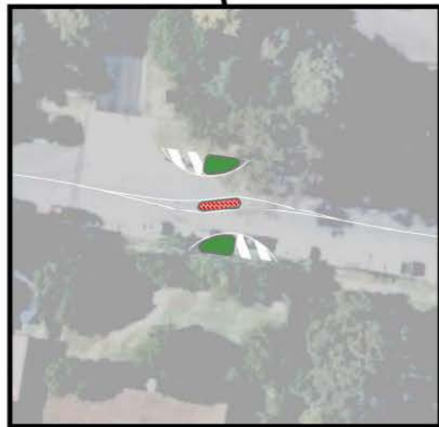
HENLEY COMMUNITY ENTRANCE