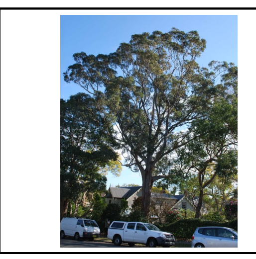
Sydney Blue Gum (Eucalyptus saligna)